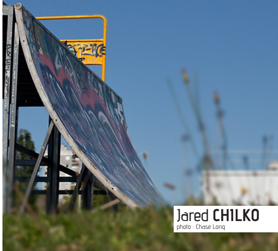
Jared CHILKO